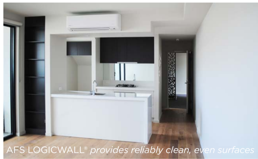
AFS LOGICWALL® provides reliably clean, even surfaces